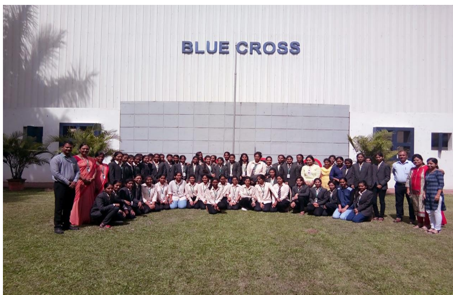
Second Year B. Pharmacy Students visited Blue Cross Laboratories Pvt. Ltd., Ambad, Nashik