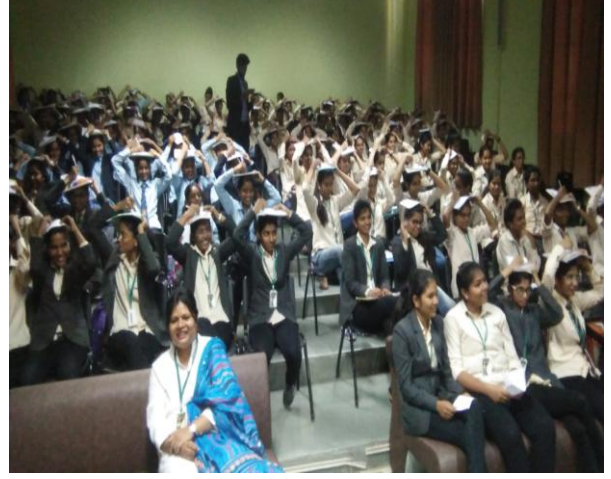
Organized Lecture by Sakal-Young Inspiration Network (YIN) Members